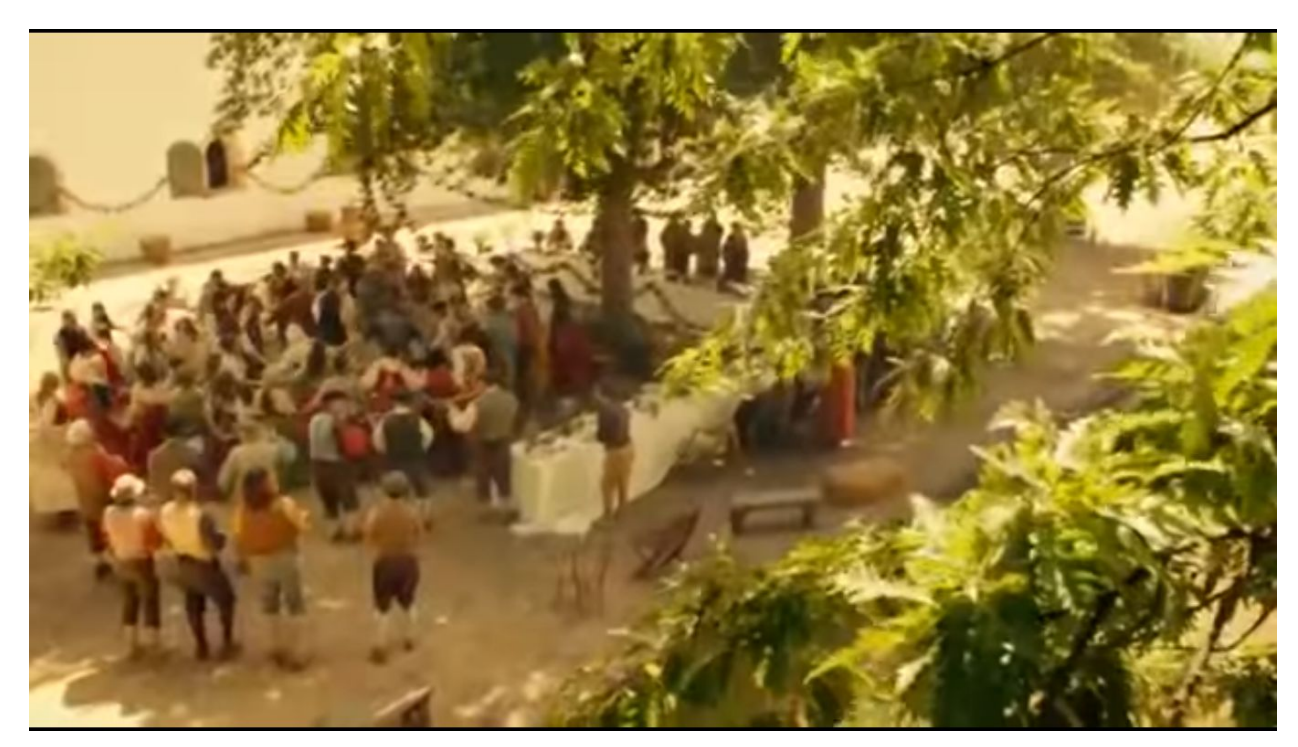
When Jonas finally sees the color