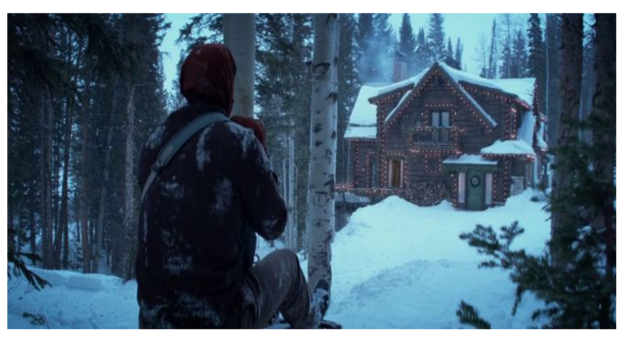
The last part of the movie was when Jonas found a house that he could live in as a normal human being.