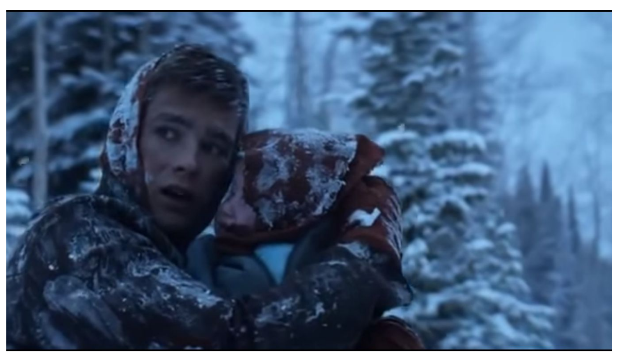
After all the suffocation after he passed the boarder, everyone can see the colors and remembers everything.