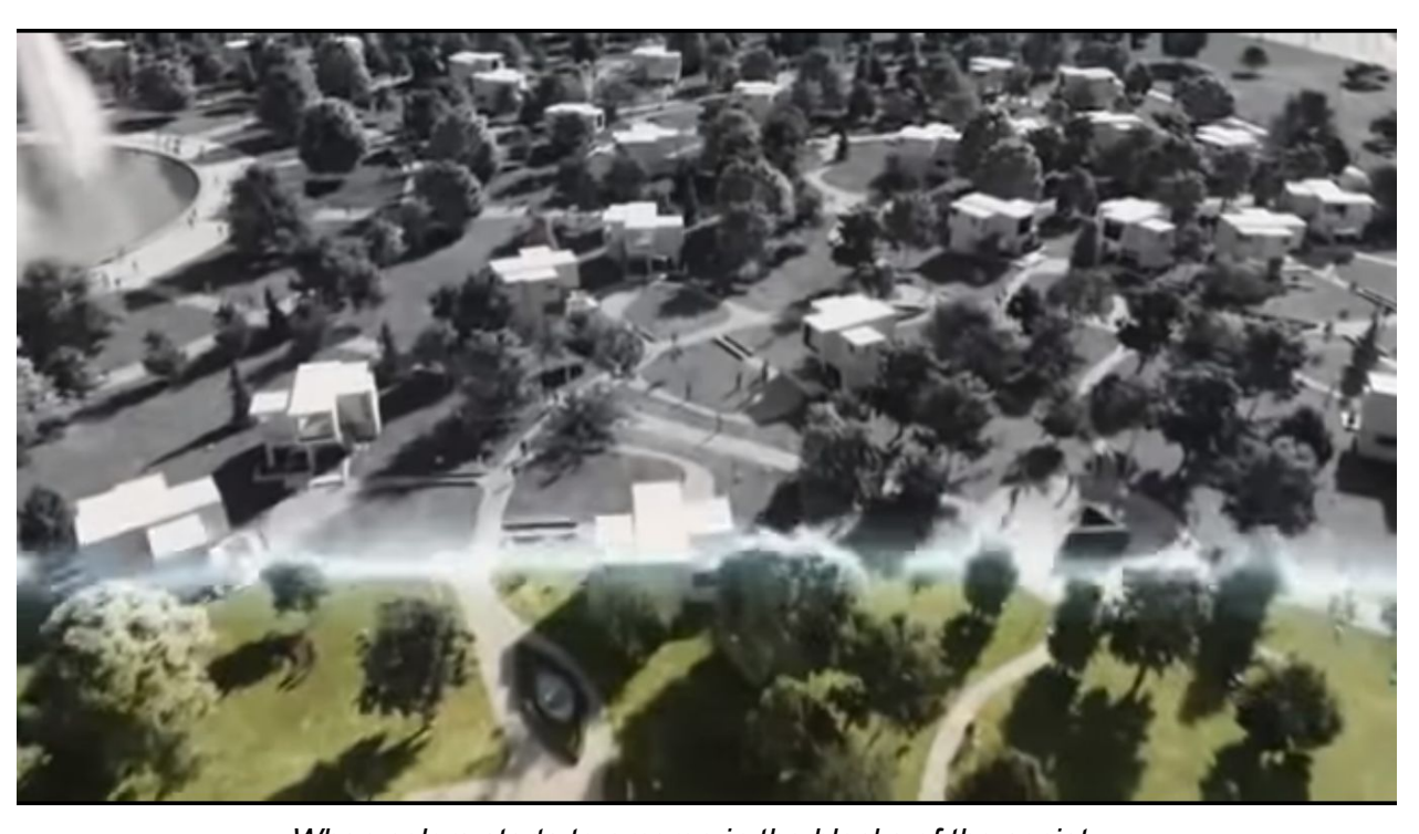
When colors starts to emerge in the blocks of the society.