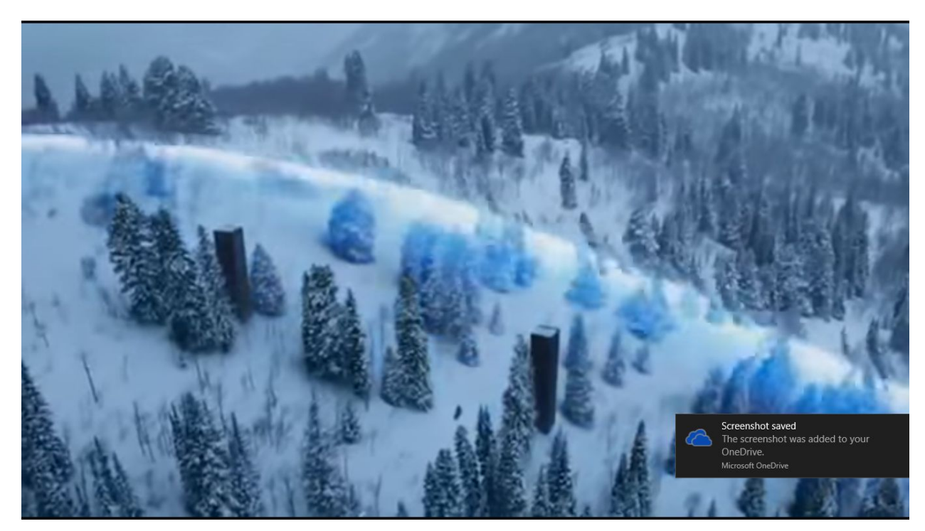
When the realisation about to strike the society.