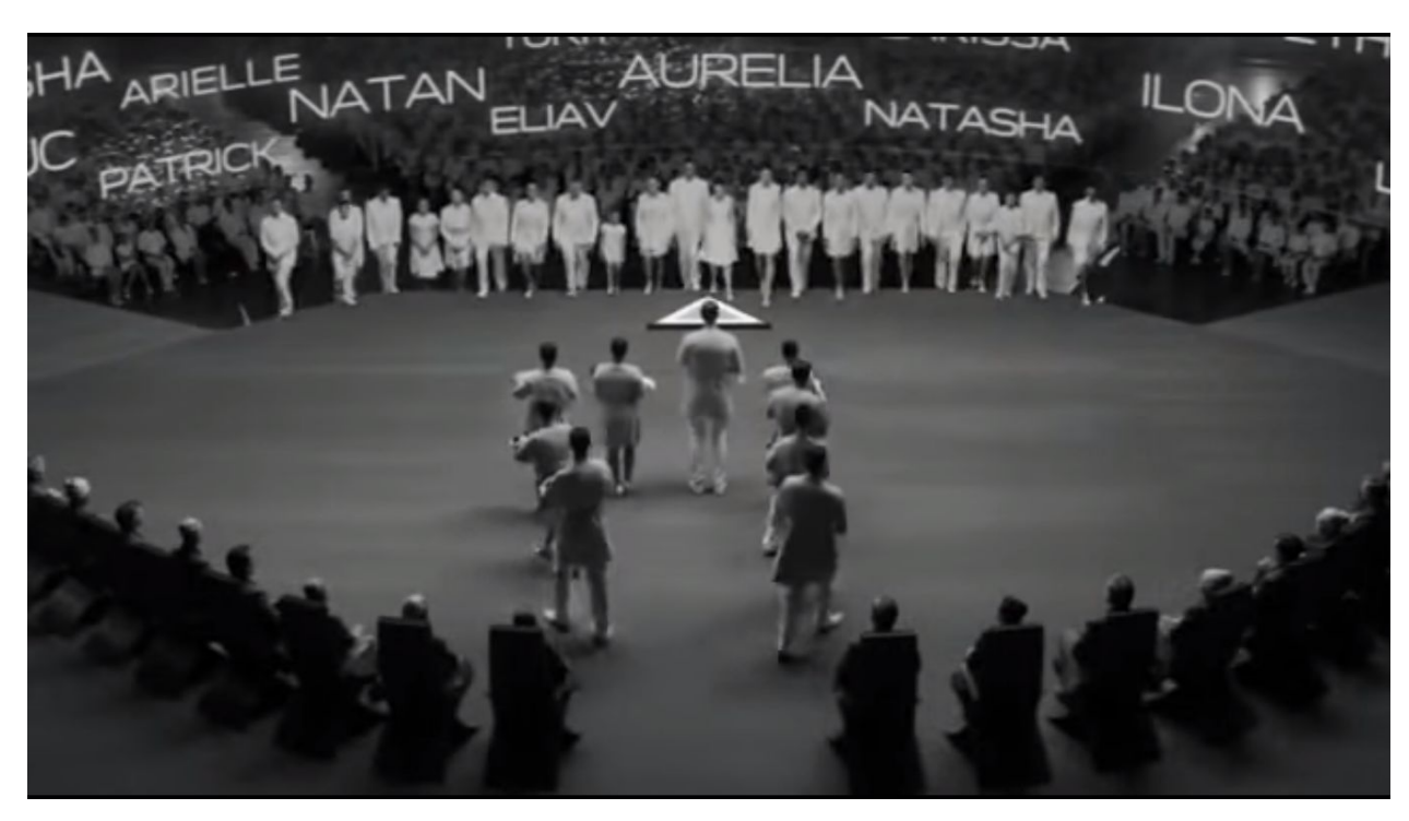
The uniformity of the society. And how they're lives are programmed and how they live in Black and White.. (excuse the sudden clarity of the picture)

In conclusion, this movie is actually about how they think the future will be like if such violence or such ruin, ruins the mind and the thinking of the leader, the traumatic experience of the leader and the over-protective thoughts of the leader. In Malaysia, the way I see it even though the mind of our leader is aware that we are living in crisis, but he seems to not make an effort to make this country a better place. Disrespecting the older and the former leader that has made a legacy in our country. Truly the movie is interesting, it has a point make such rules but some of it are not acceptable. If it's the right thing to do, why is it against the rule?